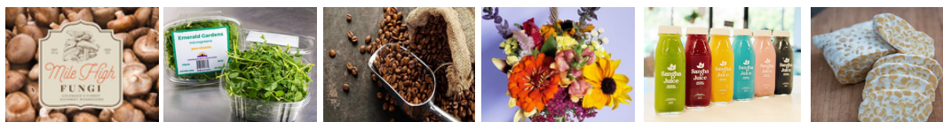
Mushrooms (5oz or 10oz)