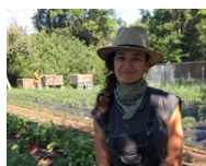
Paper Kite Farm