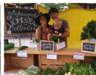
Wild Wicks Farm