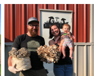
Mile High Fungi