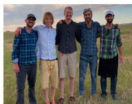
MetaCarbon Organic Farm