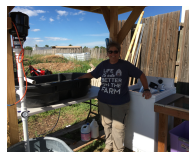
Grow Girl Organics